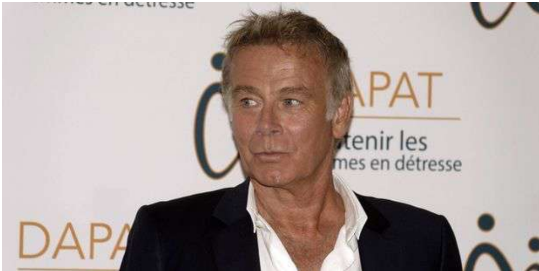
Franck Dubosc presented his new film« Rumba La Vie » on Tuesday evening

SURPRISING: Franck Dubosc : « I'm a little tired of being funny all the time. My real self is more nostalgia ». As part of the 25th edition of the Alpes d'Huez festival, which began on Monday: Franck Dubosc presented Tuesday evening, in the « out of competition » category, his new film, Rumba La Vie, whose release is announced for August 24 next... 22