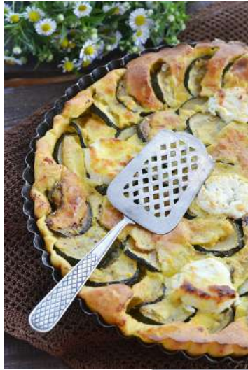
Zucchini and goat cheese tart (marmiton)

And as a bonus, a burger with potato pancakes, Winter is here, make way for hot dishes!!!!