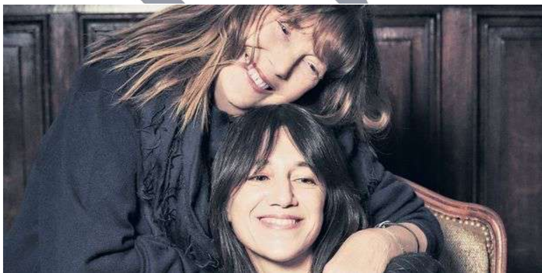
Jane Birkin and Charlotte Gainsbourg, the December 21 at the Regina Hostel, in Paris

GAINSBOURG-BIRKIN, a mother-daughter dialogue: Jane Gainsbourg filmed her mother, Jane Birkin, for a documentary full of modest love, on screens on January 12. « From my mother, I also try to reproduce the fun and humor », says Charlotte Gainsbourg. As their resemblance, it is « increasingly strong », according to Jane Birkin... 3