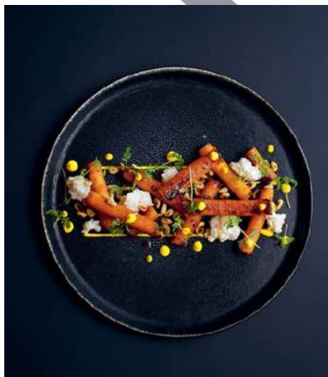
Thomas Bouanich and Marie-Pierre Morel

AT TABLE - GASTRONOMIC AND CREATIVE VEGETABLE DISHES... Butternut, goat cheese and pine nuts...And very decorative!!!!