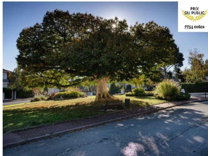
Official Pictures of the Tree of the Year competition

It is 300 years old and is located at Place Audran, in the Celle-Saint-Cloud, in the Yvelines. It is this chestnut tree that won the public prize in the « Tree of the Year » competition, organized for 10 years by the magazine « Terre sauvage » and the forest tourism office (ONF). 18