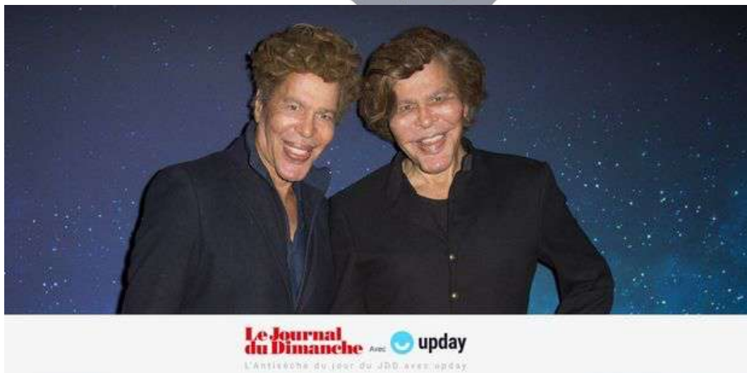
Igor and Grichka Bogdanoff at the launch of their latest book, October 20 in Paris

> Mysterious characters. Protruding cheekbones, protruding chin... The twins claimed to have an « alien face » and have always maintained the mystery about the causes of the spectacular transformation of their faces... 5