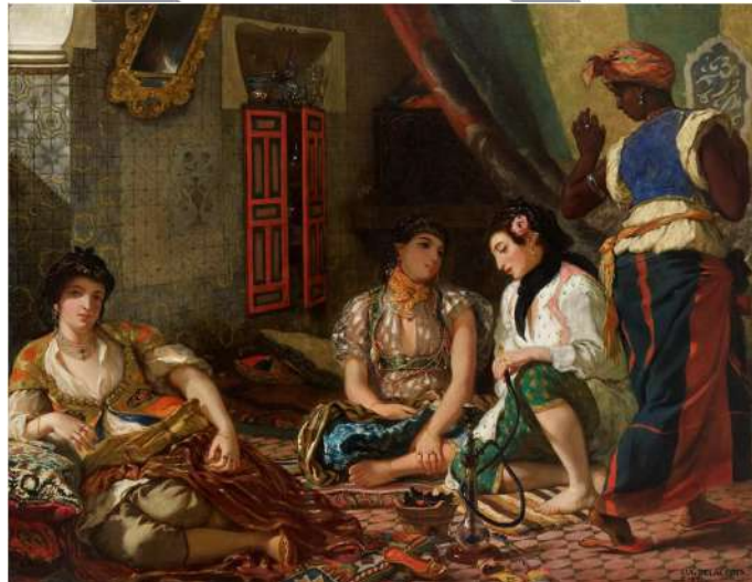
Eugène Delacroix, Femmes d'Alger dans leur appartement (après restauration, 2021)

We appreciate: The painting "Les femmes d'Alger" by Delacroix has regained all its brilliance!!!!