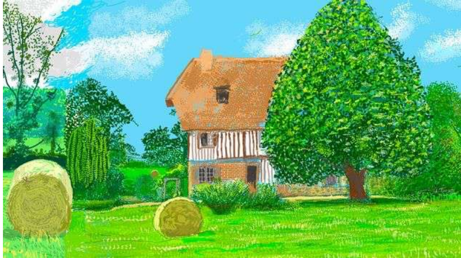
A Year in Normandie, David Hockney's exhibition at the Musée de l'Orangerie

1 work in 1 minute: A year in Normandy by David Hockney!!!!